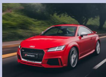
Motor vehicles: $65,000