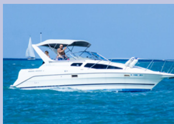
Marine vessels: $100,000