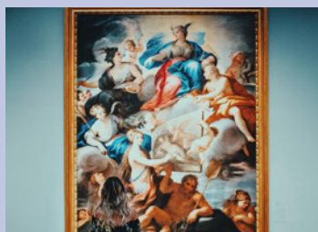
Fine art (per item): $100,000